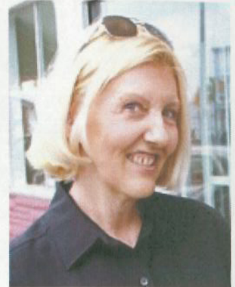
Linda Hall/St. Mary's Tuition Assistance Fund

To Benefit Jennings County High School Graduates who have participated in High School Golf or Baseball.