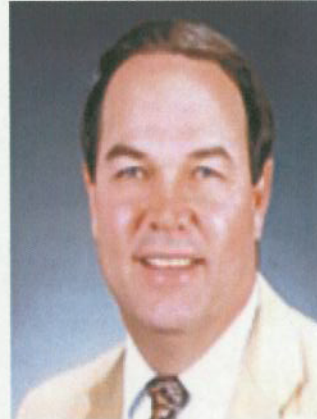
Bob Barber Memorial Scholarship

To benefit Jennings County High School Graduates who are furthering education at a college or university.